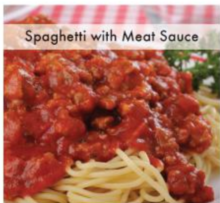
Spaghetti with Meat Sauce